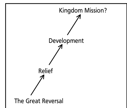
Figure 1: YWAM's Journey to Kingdom Mission.

YWAM is currently working on a statement of what discipling the nations and realizing the Kingdom might look like. While this is very much in process, we think it is in large part about the transformation of individual lives, communities, cultures and the earth. It has to do with realizing God's intentions for people and the earth. It is God-centered. It is about realizing shalom and seeing redemption in every aspect of life. It is about justice for all people. It is about destroying the powers of darkness, wherever they are found.